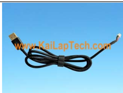
Соединительный USB-кабель Деталь No. KLT-USB1A-Cable

Удлинитель кабеля USB. Продано отдельно.